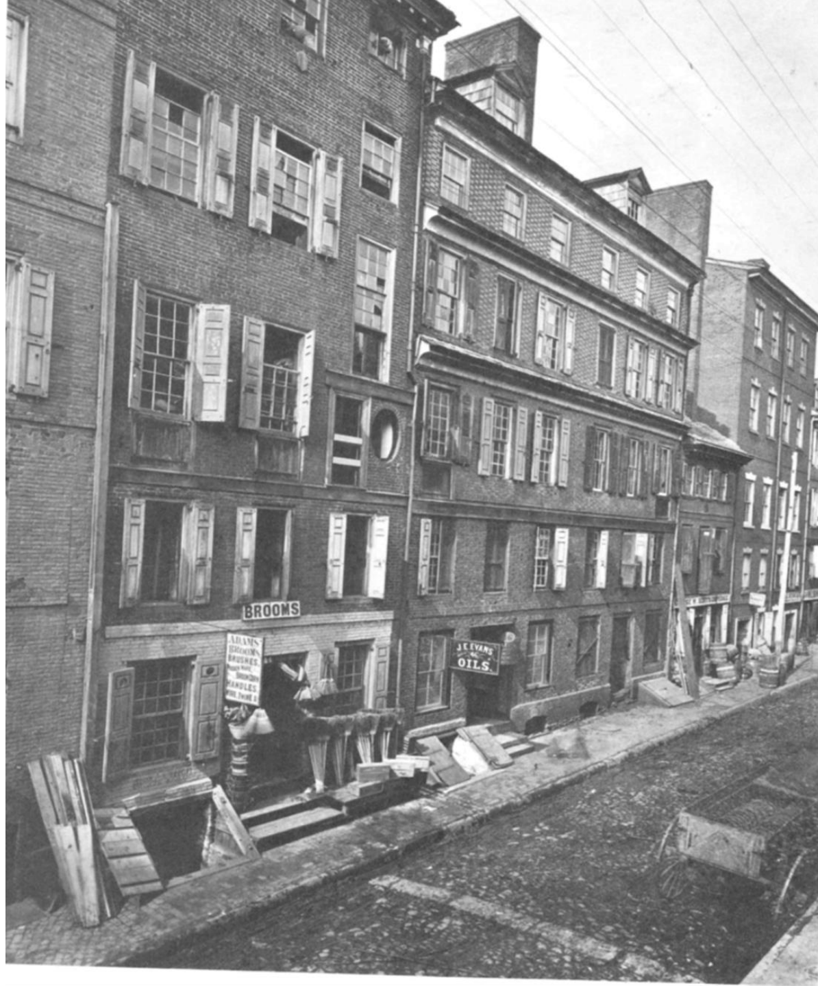
Water Street 1868