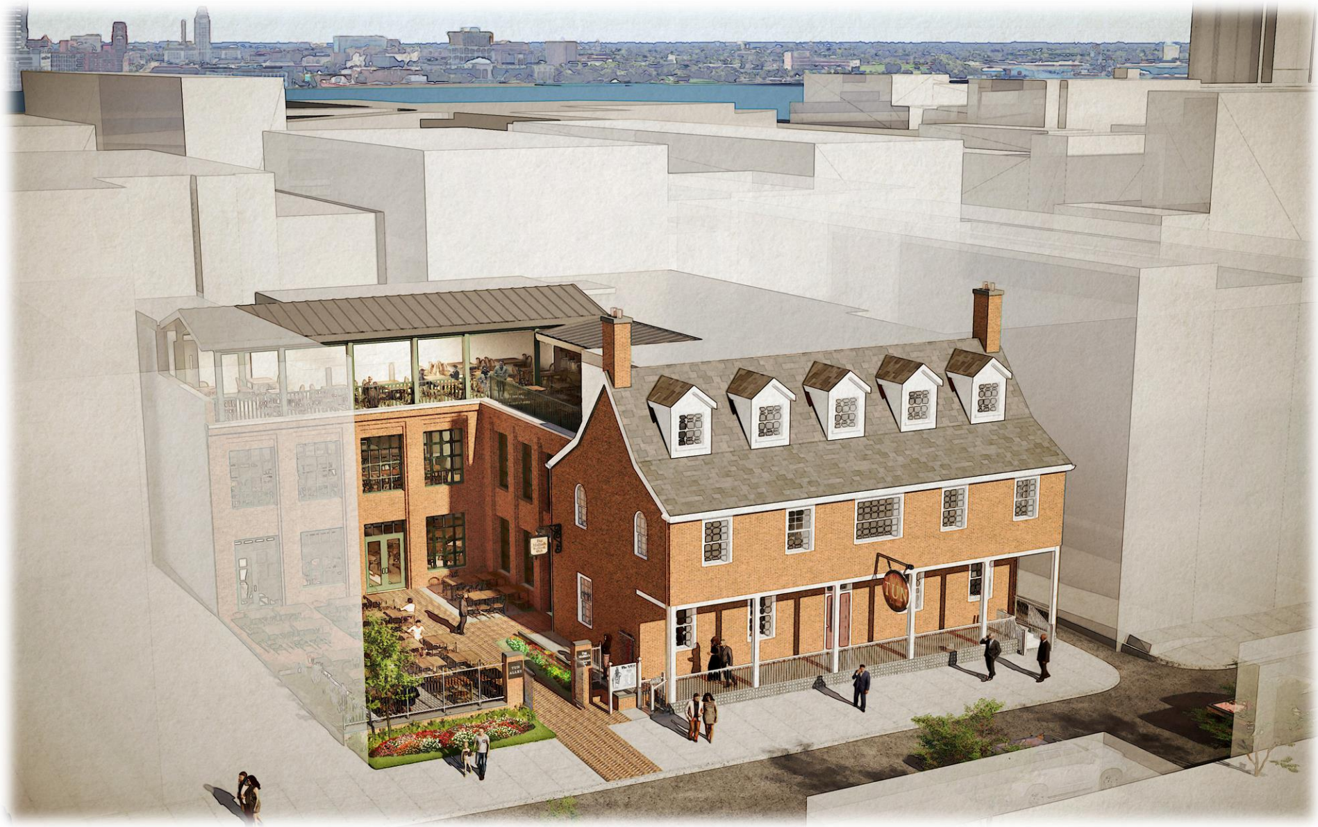
15 – 25 S. 2 nd Street, Philadelphia, PA